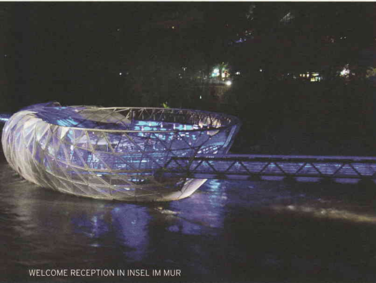
WELCOME RECEPTION IN INSEL IM MUR