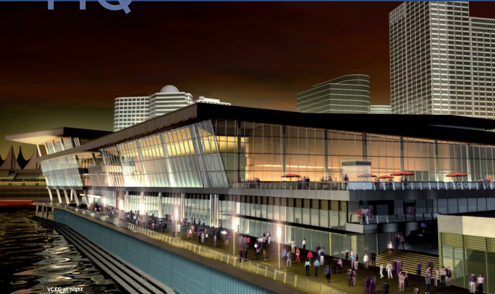
VCEC at night